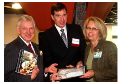
Gold Star Award for Worksite LiveWELL Carolinas!