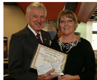
Gold Star Award for Healthcare Southeastern Regional Medical Center Community Health Services – Project HEALTH