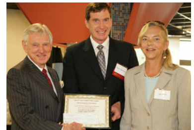
Gold Star Award for School District - Camp Lejeune Dependents Schools Child Nutrition Department