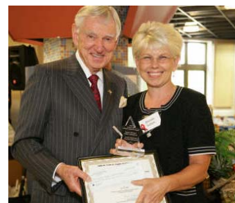
Gold Star Award for Business/Other - Rockingham County Cooperative Extension