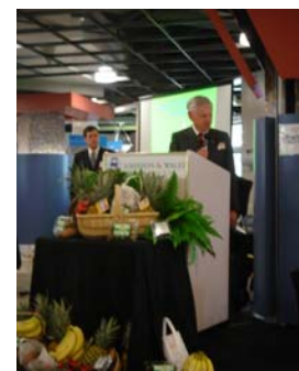
David H. Murdock, Chairman and owner of Dole Food Company

added bonus of mini-grants. Gold Star winners received $350 and Silver Star winners received $200 to use for further projects to increase fruit and vegetable consumption and provide nutrition education.