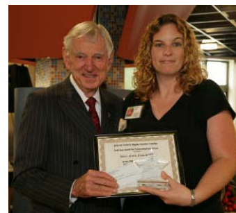
Gold Star Award for Community/Civic Group Inter-Faith Food Shuttle

At three elementary schools in Pasquotank County, second- and third-grade children received hands-on experience through the "Kids in the Garden" program. Cooperative Extension agents worked collaboratively with the schools to engage the children in interactive lessons about plants, soil, nutrition and physical activity.